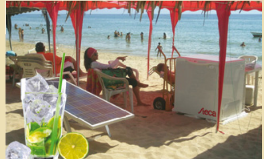
Cold drinks, Carribean